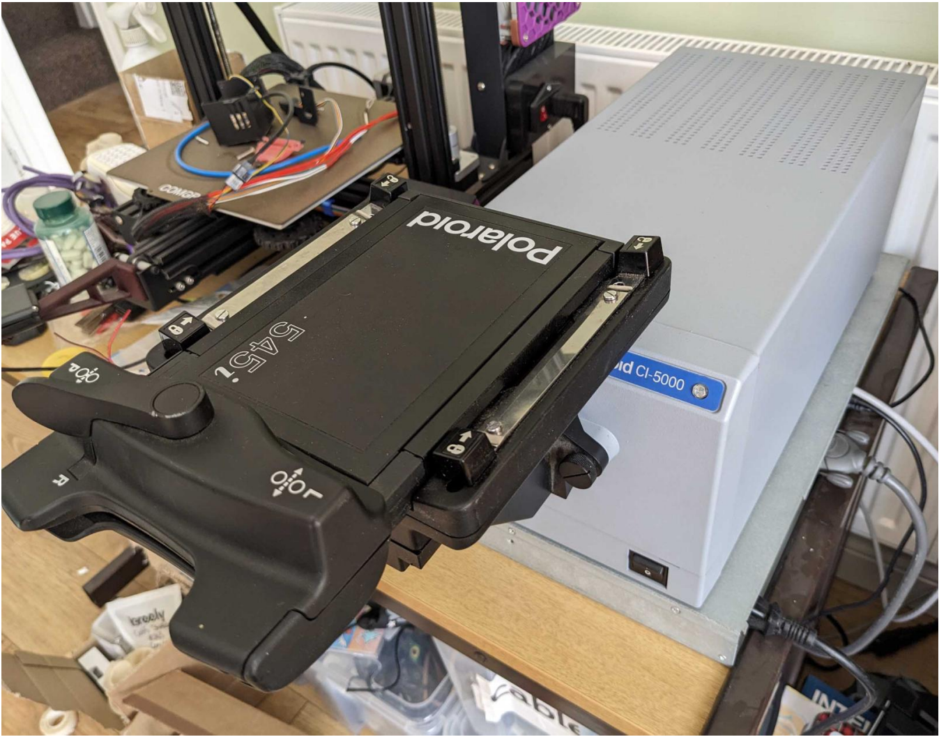
(you'll have to excuse the messy workbench!)